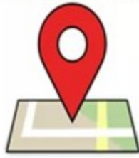
Proof of Address Current Utility or Lease Agreement